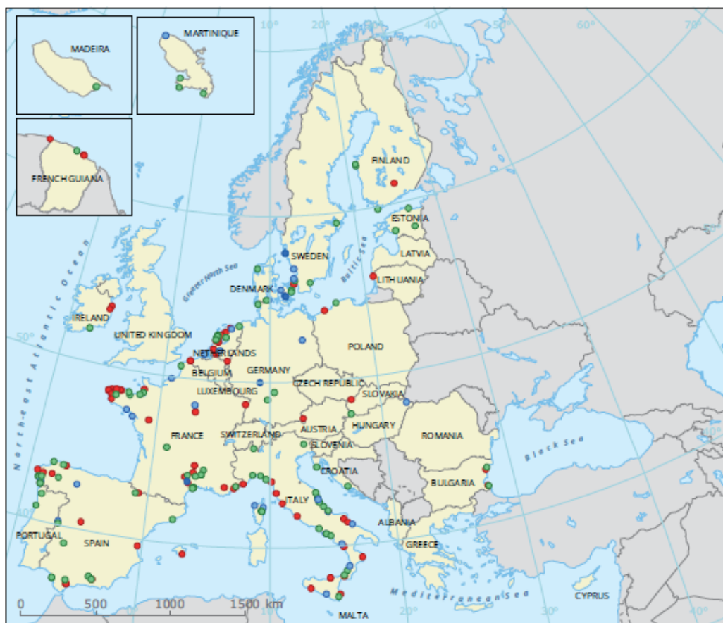
Map 2.1 Improvements and deteriorations in bathing water quality

Bathing water sites where quality improved from poor in 2014 to sufficient, good, or excellent in 2015; and bathing water sites where quality deteriorated from excellent, sufficient, or good in 2014 to poor in 2015